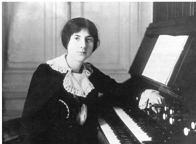
Boulanger's official portrait as winner of the 1913 Prix de Rome

The legacy of Lili Boulanger is intertwined deeply with her sister's. Nadia herself gave up composing in 1922, but through her long career of teaching composition she arguably shaped the future of classical music more than any single person during the 20th century. Nadia was directly responsible for the performance and publication of her younger sister's compositions. She edited and occasionally transcribed manuscripts, and oversaw recordings of Lili's music, sharing her sister's work with the hundreds of composition students she taught until her death in 1979 — and with the larger public through annual concerts she organized in remembrance of Lili.